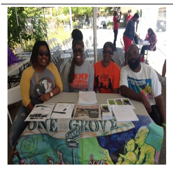
ONE GROVE Foundation